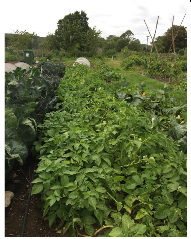
Figure 6 - Allotments