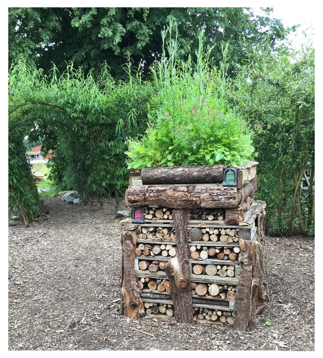
Figure 11 – Bug Hotel in the Sensory Garden