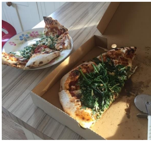
Figure 27 – Pizza gifted as a way of thanks to Aoife for all the Chi Gung sessions