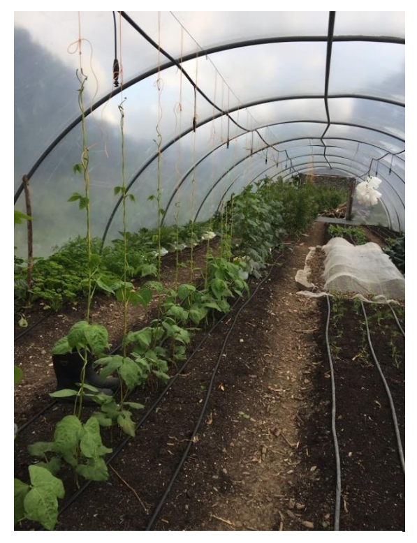
Figure 8 – RED gardens project polytunnel