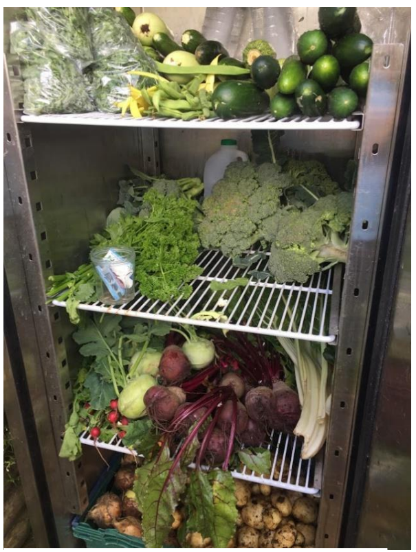
Figure 10 – Liam's fridge, filled with food grown in the RED gardens