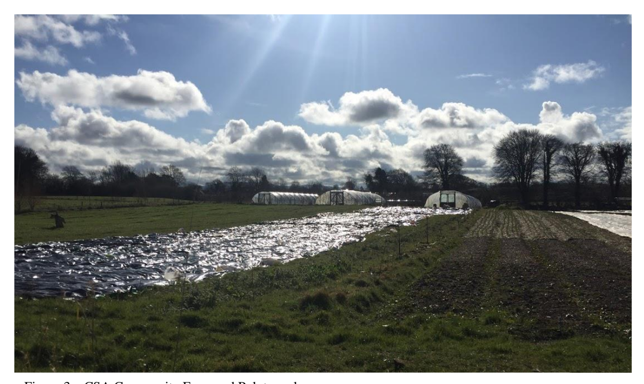
Figure \ 3-CSA \ Community \ Farm \ and \ Polytunnels