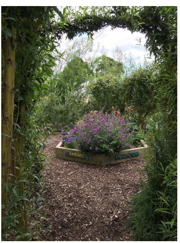
Figure 14 - Sight area in the Sensory Garden