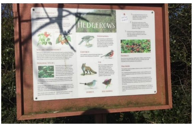
Figure 17 – One of the Educational signs that can be found on the biodiversity trail along the perimeter of the Ecovillage