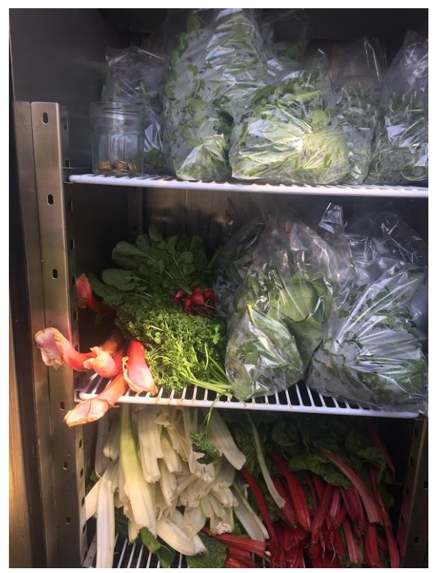
Figure 9 – Liam's fridge