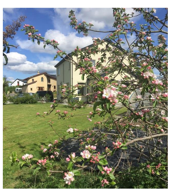
Figure 2 - Distant photo of other homes in the Ecovillage, cob house on the left and timber framed lime hemp rendered house on the right