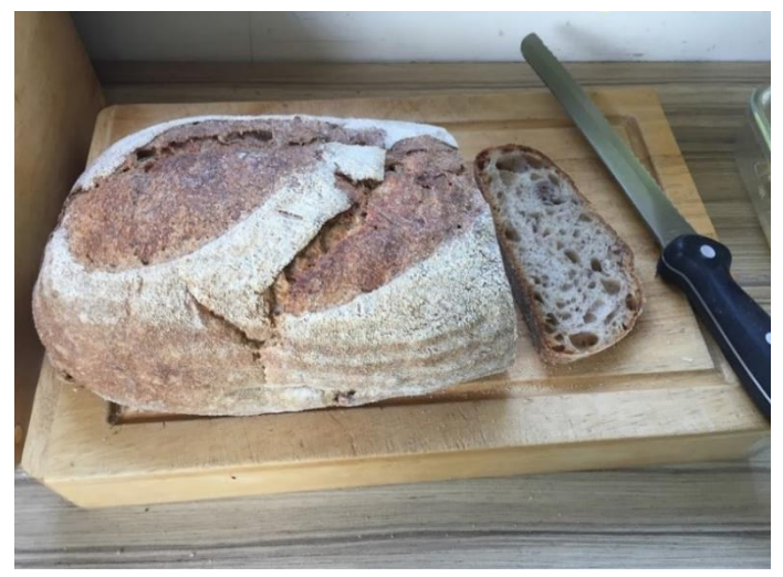
Figure 26- Fresh sourdough bread from Riot and Rye bakery in the Ecovillage