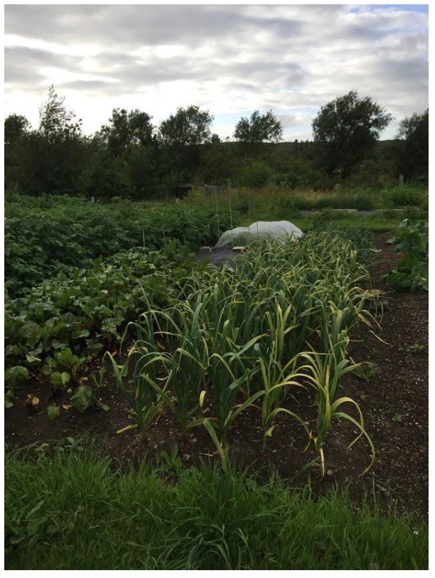
Figure 5 - Allotment