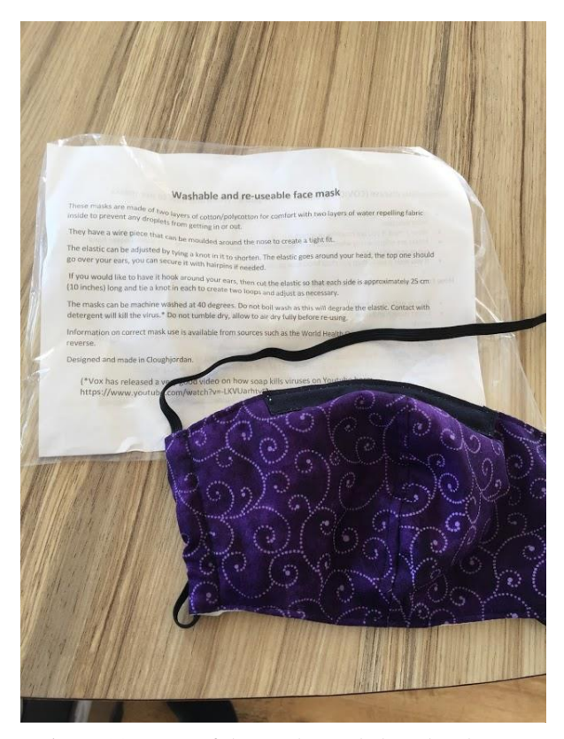
Figure 28 – One of the masks made by a local member during the pandemic