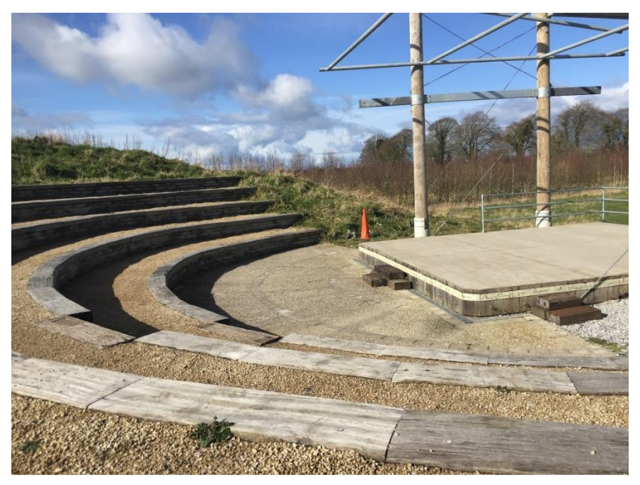
Figure 15 – The Community amphitheatre, this was where the community meetings took place when people had to socially distance. Usually it is a space for live music, theatre performances and events.