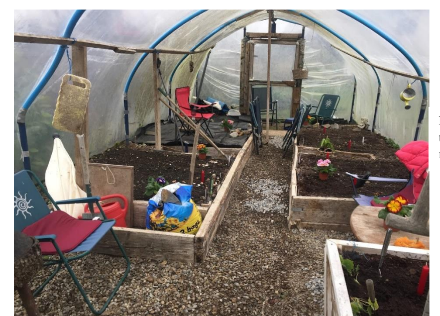
Figure 18 – The transformation of the polytunnel into a socially distant meeting space