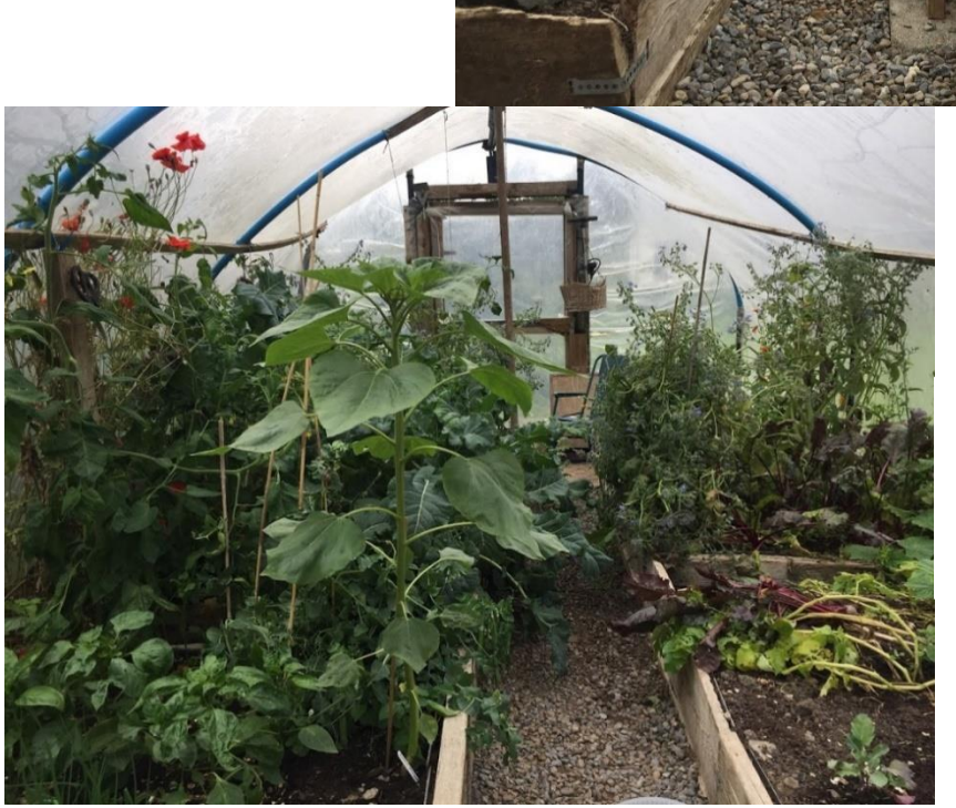
Figure 20 – By now the plants did not leave much space for anyone to sit inside and still be able to see each other...