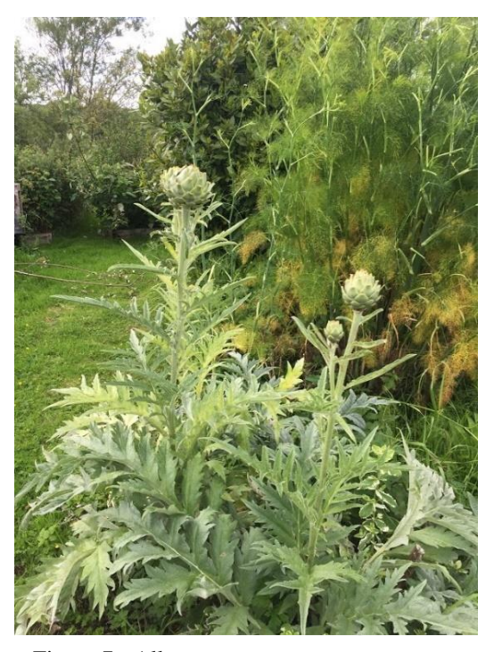
Figure 7 - Allotments