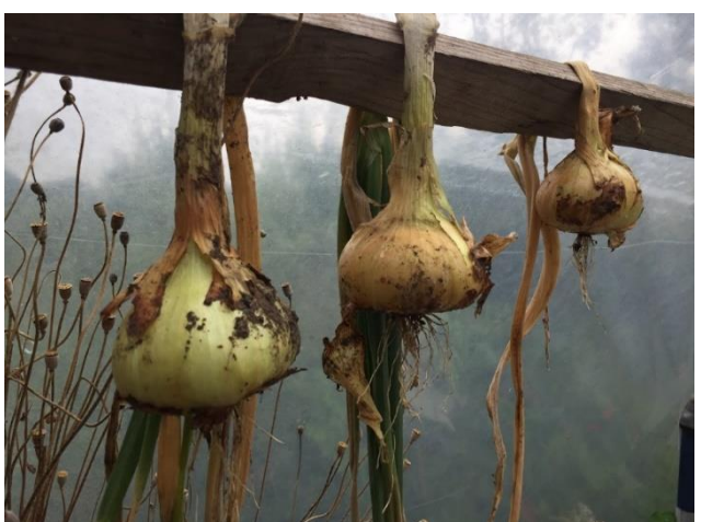
Figures 21-25 depict the polytunnel and some of the produce Aoife and I grew there