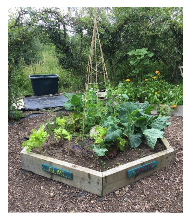
Figure 13 – Taste area in the Sensory Garden