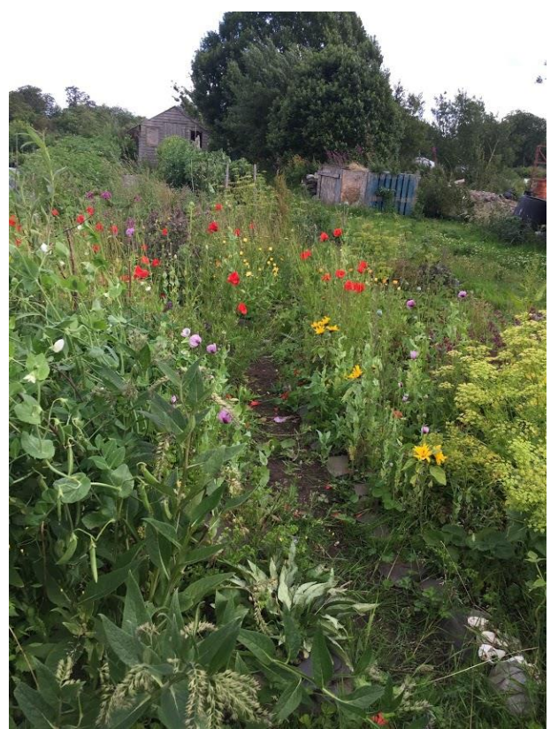
Figure 4 - Allotment