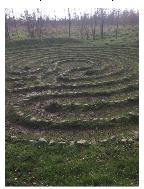
Figure 16 – The Labyrinth, in the shape of a seven circle Celtic spiral, individuals can walk the labyrinth as a form of meditation. It has been made with stones that have been gathered by members from around the Ecovillage