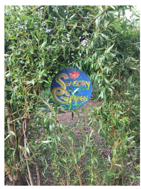
Figure 12 – Sensory Garden, hand painted sign