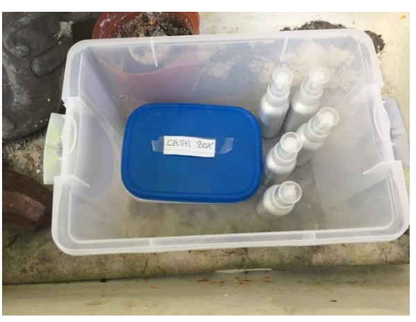
Figure 29 – Sanitiser made by a member following the clear out of stock in the shops, money was to be left in the honesty box