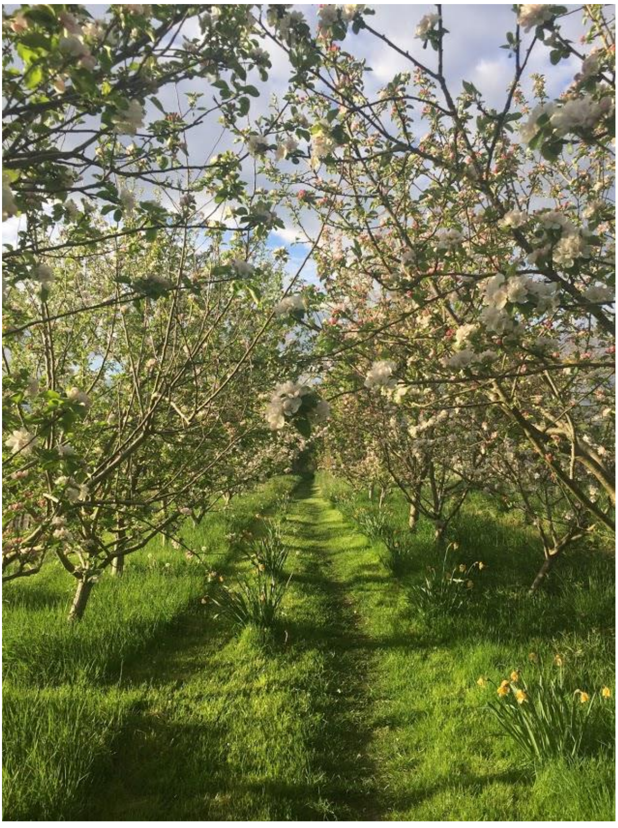
Figure \ 30-The \ apple \ tree \ walk \ along \ the \ allot ments, \ with \ over \ 70 \ different \ native \ Irish \ species