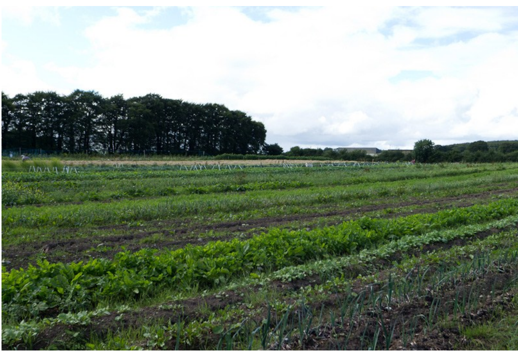
Caption: view of CEV's farmland (cultivated by Cloughjordan Community Farm). Photo shot by the author in August 2012.