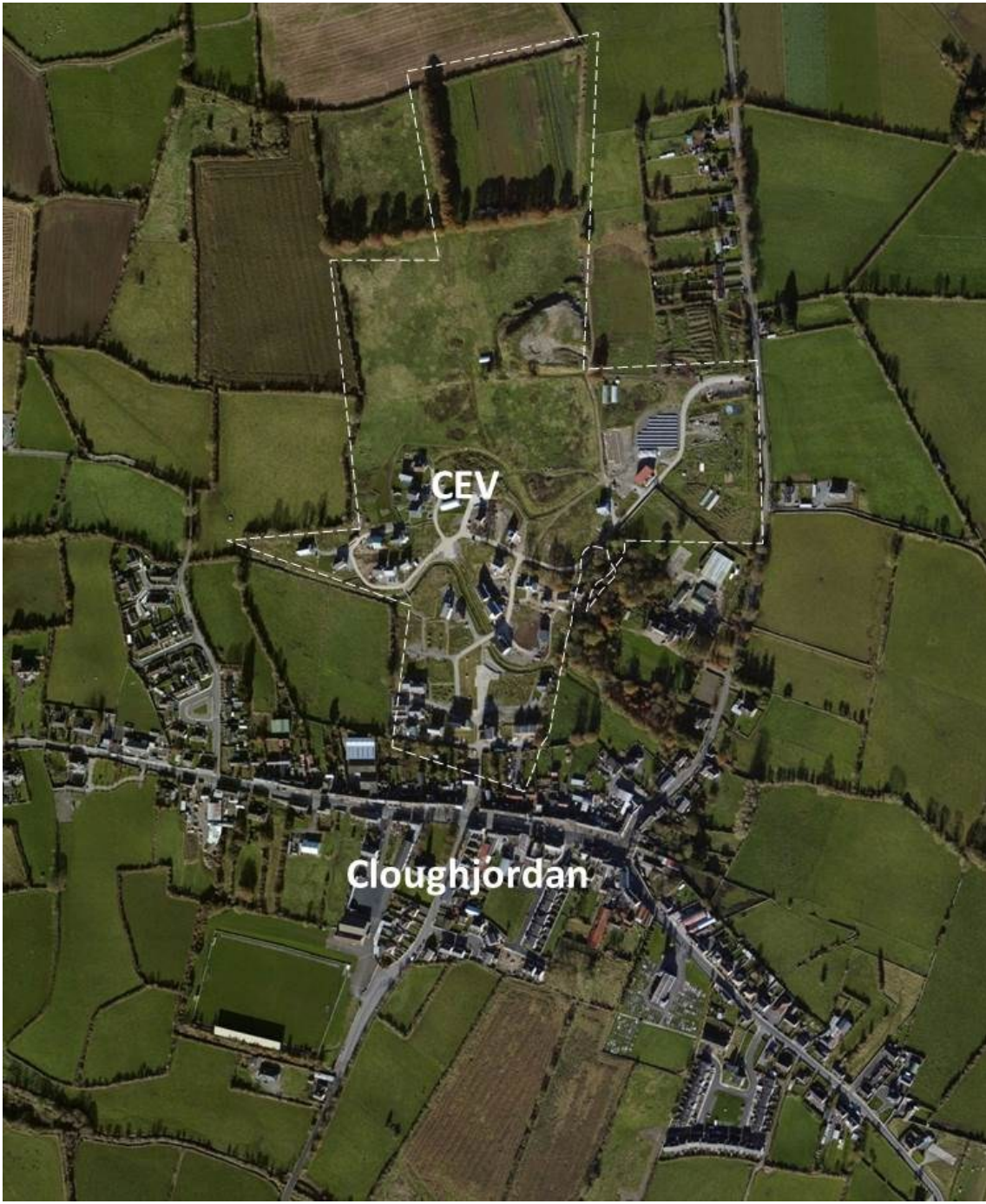
Caption: a satellite photo of Cloughjordan as of 2011. (Tags added by the author.)