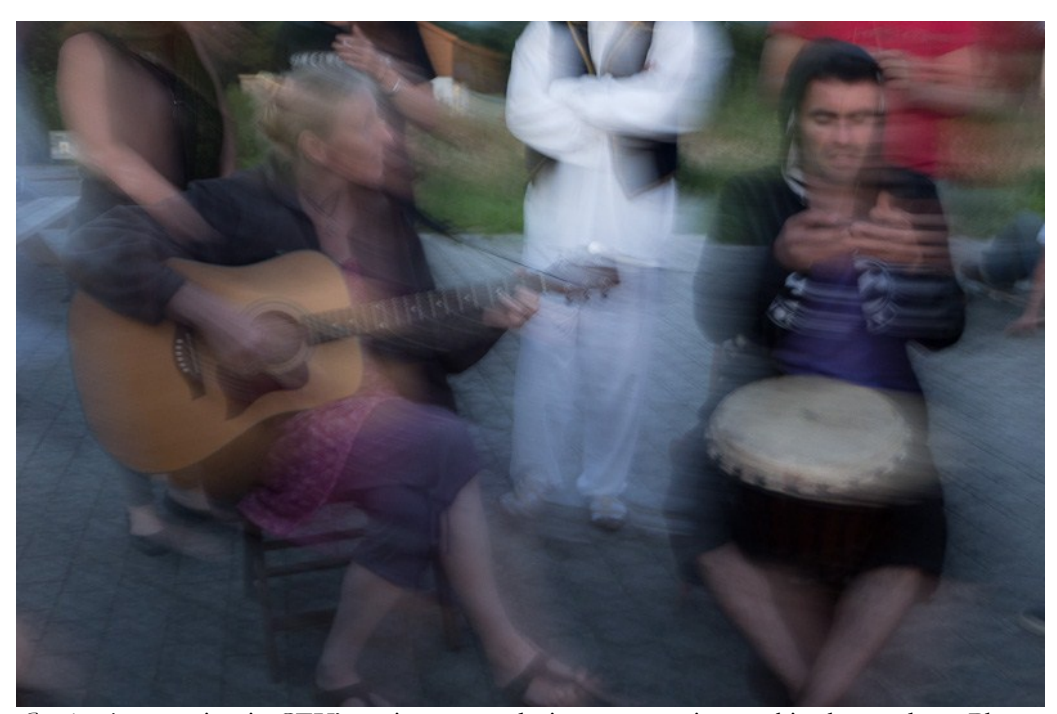
Caption: jam session in CEV's main square, during community meal in the outdoor.